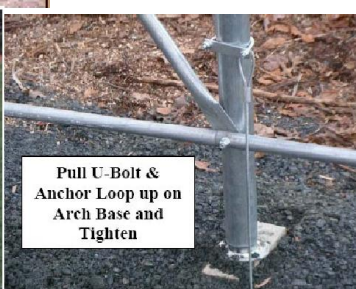
Pull U-Bolt & Anchor Loop up on Arch Base and Tighten